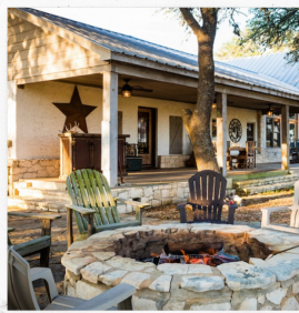
Rural Structures: Houses, Barns, Barndominiums