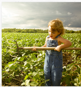
Family on the Farm in Action