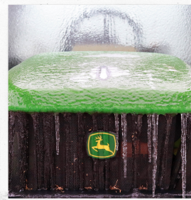
Elements of Design in Agricultural Equipment