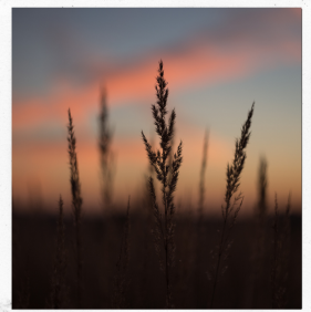
Shadows and Silhouettes in Nature